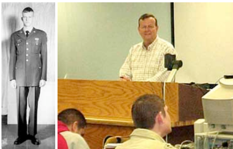
Then & Now